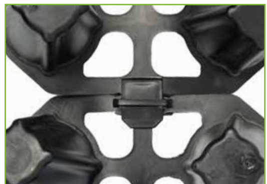
Long spacer 6 cm