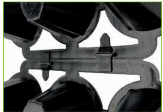
Short spacer 4 cm