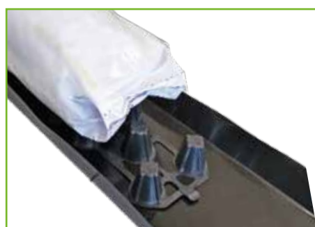
Long spacer 6 cm