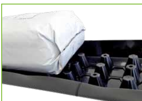
Short spacer 4 cm